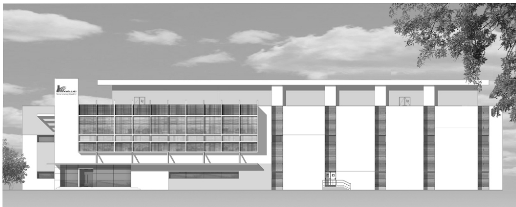
The new pre-clinical facility at VIMTA Life Sciences campus

The training school built at VIMTA Life Sciences has contributed significantly in capacity building and propelling the company to readiness to forge more long term partnerships with global companies.